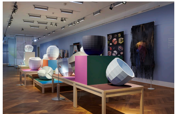
Hella Jongerius – Breathing Colour, Exhibition view Gewerbemuseum Winterthur Photo: Bernd Grundmann, jpg 300dpi A5