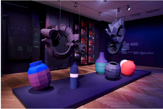
Hella Jongerius – Breathing Colour, Exhibition view Gewerbemuseum Winterthur Photo: Bernd Grundmann, jpg 300dpi A5

High resolution media images are available to download at www.gewerbemuseum.ch . Further photos with views of the exhibition rooms will be provided at the opening. Please respect the rules regarding copyrights and crediting the photographers, and use these images only in connection with reporting on “Hella Jongerius – Breathing Colour” at the Gewerbemuseum Winterthur. Thank you very much.