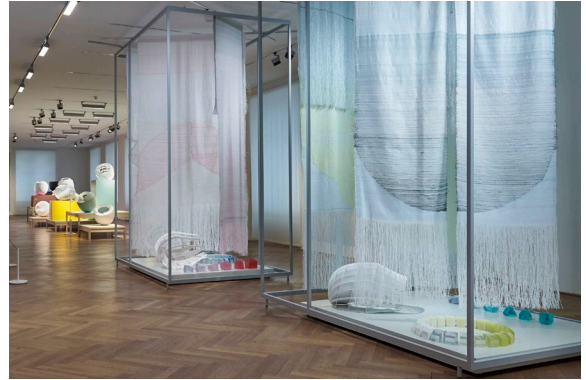
Hella Jongerius – Breathing Colour, Exhibition view Gewerbemuseum Winterthur Photo: Bernd Grundmann, jpg 300dpi A5