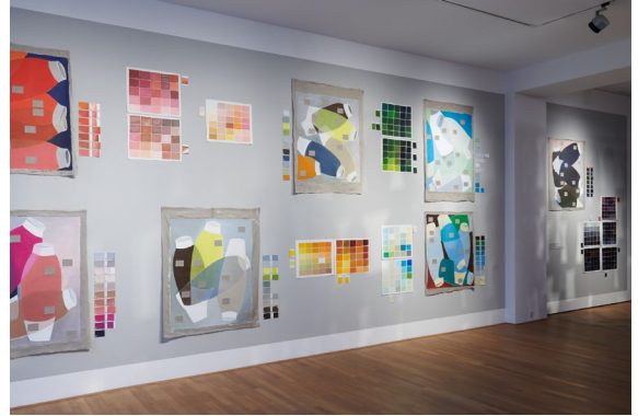
Hella Jongerius – Breathing Colour, Exhibition view Gewerbemuseum Winterthur jpg 300dpi A5