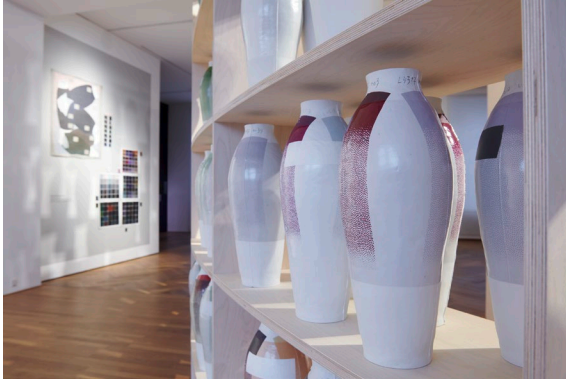
Hella Jongerius – Breathing Colour, Exhibition view Gewerbemuseum Winterthur Photo: Bernd Grundmann, jpg 300dpi A5