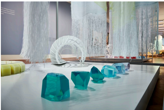
Hella Jongerius – Breathing Colour, Exhibition view Gewerbemuseum Winterthur Photo: Bernd Grundmann, jpg 300dpi A5