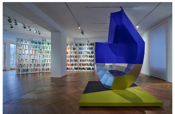
Hella Jongerius – Breathing Colour, Exhibition view Gewerbemuseum Winterthur Photo: Bernd Grundmann, jpg 300dpi A5